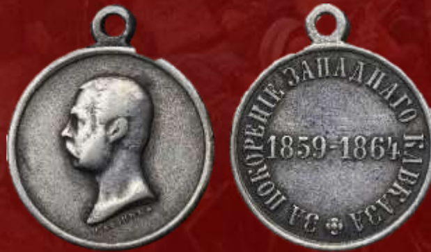
Award medal “For the Conquest of the Western Caucasus. 1859-1864.”