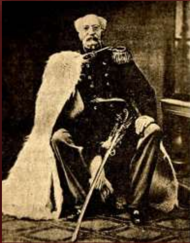
Grigory Zass (1797–1883)