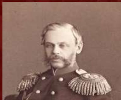
Dmitrii Miliutin (1816-1912)

“In a policy memorandum of 1857 Dmitrii Miliutin, chief of staff to Bariatinskii, summarized the new thinking on dealing with the northwestern highlanders. The idea, Miliutin claimed, was not to clear the highlands and coastal areas of Circassians so that these regions could be settled by productive farmers, as had happened in other parts of the empire’s periphery. Rather, eliminating the Circassians was to be an end in itself—to cleanse the land of hostile elements. ” (King, 2008, p. 94).