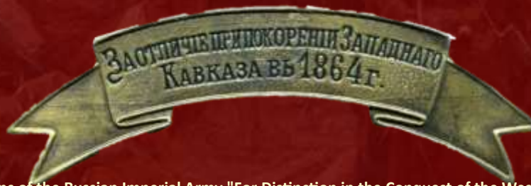
Award ribbons of the Russian Imperial Army "For Distinction in the Conquest of the Western Caucasus"

“Evdokimov's (Nikolai Ivanovich Evdokimov, Russian General, 1804-1873) plan was quite different. It was impossible to get along with the Circassians, it was impossible to tie them to oneself in any way, it was also impossible to leave them alone, because this threatened the security of Russia, of course, not because of the trifling rapacity of the Abreks, but because the Western powers and Turkey could find powerful support in the mountain population in the event of war. From this followed the conclusion that the Circassians, for the good of Russia, must be completely destroyed. How to accomplish this destruction? The most practical way was by expelling them to Turkey and occupying their lands with the Russian population. This plan, similar to the murder of one people by another, represented something majestic in its cruelty and contempt for human rights. ... Having a huge practical mind, indestructible energy, free from any sensitivity, completely uneducated, only literate, he calmly weighed the relations of the Russians and the Circassians and made his decision in terms of "pacification" through "extermination" (Tikhomirov, 2000, pp. 129-130).