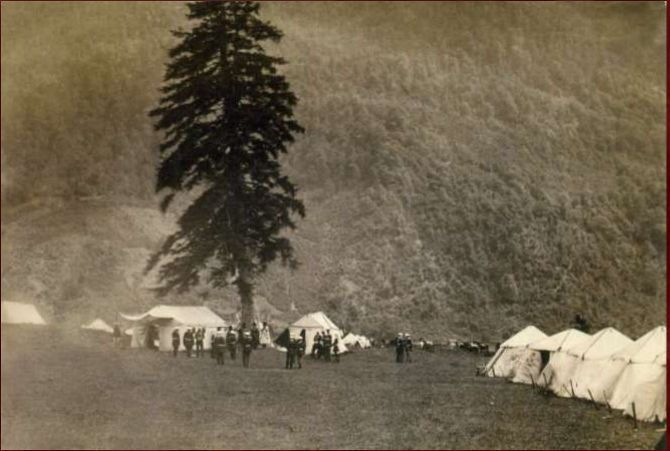
Russian troops in Kbaada, Circassia, 1864

“Where Pushkin saw the mountains from a distance and gleaned what he could around the smoking hearths of Piatigorsk, Lermontov saw things in much grittier detail: gory battles; villages burned; women and children murdered or displaced; military units welcomed back to their forts in triumph, only to find, days later, highland warriors preparing to exact their revenge. “I love my native land but love it strangely,” Lermontov wrote, “ The glory bought by blood and treason ” (King, 2008, pp. 113-114).